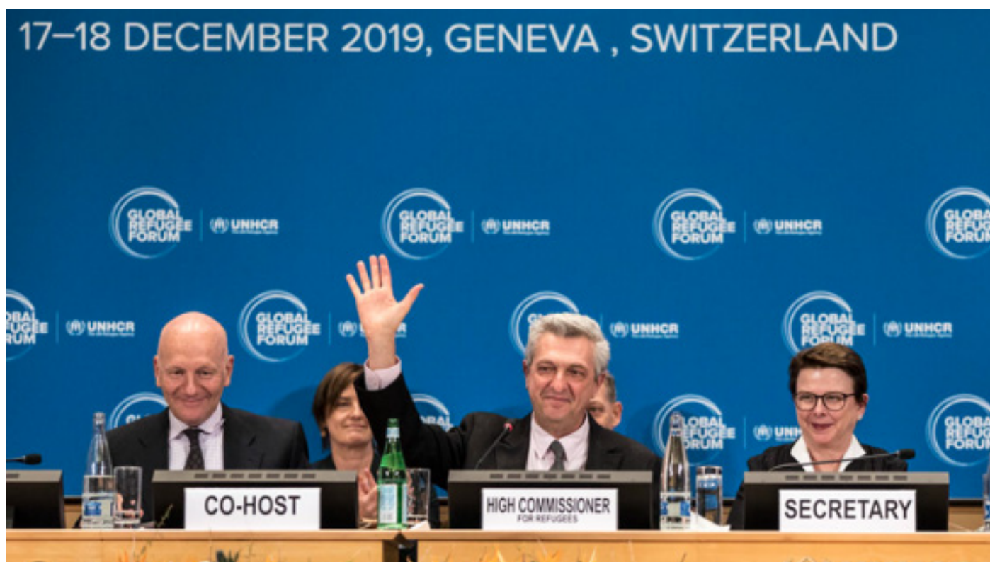
2019 Global Refugee Forum.

In December 2019, as a follow-up to the GCR, the inaugural Global Refugee Forum was held in Geneva, Switzerland. The aim of the Forum was to translate the principle of international responsibility into action through pledging, commitments, and sharing of best practices. The event was co-hosted by UNHCR and Switzerland, and co-convened with Costa Rica, Ethiopia, Germany, Pakistan and Türkiye.