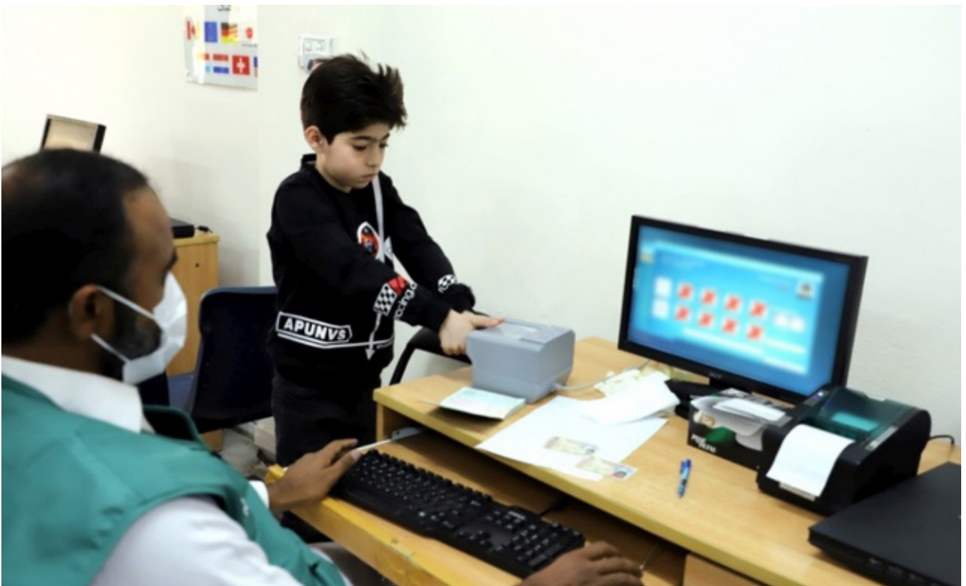
A young Afghan refugee is biometrically registered for a smartcard at a centre in Rawalpindi, Pakistan.

In both Iran and Pakistan, despite the challenges and needs of their respective populations, both countries have maintained a commitment to refugees. They have each provided services, especially in areas of education, healthcare, and to an extent livelihoods. It is important that the Support Platform remains on-hand to continue to generate and solidify international solidarity for Afghan refugees in Pakistan, and the communities that host them.