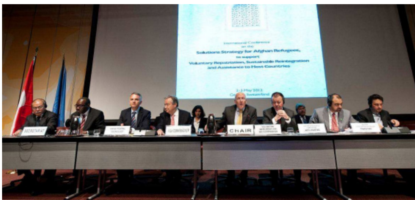
International Conference on the Solutions Strategy for Afghan Refugees, Opening Session.

The Solutions Strategy for Afghan Refugees 1 (SSAR), adopted by Afghanistan, Iran, Pakistan and UNHCR and endorsed by the international community in 2012, remains the cornerstone of the approach in the subregion to enable durable solutions.