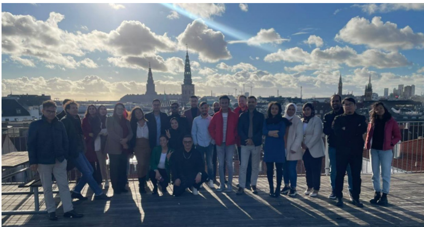
ADSP capacity building training with the Afghan diaspora in 2022.

The Asia Displacement Solutions Platform (ADSP) is a joint initiative of the Danish Refugee Council, International Rescue Committee, and the Norwegian Refugee Council, which aims to contribute to developing solutions for populations affected by displacement in the region. Drawing upon its members' operational presence throughout Asia, and its extensive advocacy networks, ADSP engages in evidence-based advocacy initiatives to support improved outcomes for displacement-affected communities from Afghanistan and Myanmar. ADSP was formed in Afghanistan in 2018 and has member presence in Afghanistan, Iran, Pakistan and Tajikistan. Since its inception, ADSP has been engaged in research, advocacy and coordination activities supporting long-term solutions for displaced Afghans. ADSP's 2023 – 2025 Strategy commits the organisation to engage with multilateral policy frameworks like the Support Platform for the SSAR. The aim is to strengthen these entities and ensure that decisions and policy informed by input from civil society and non-governmental organisations.