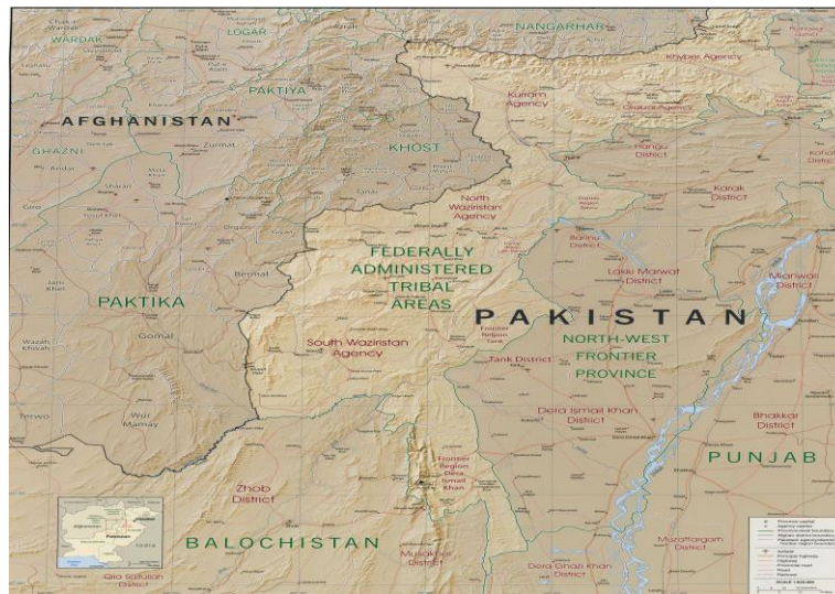
Map.1: Afghanistan – Pakistan: Central Border

Source: University of Texas University 13