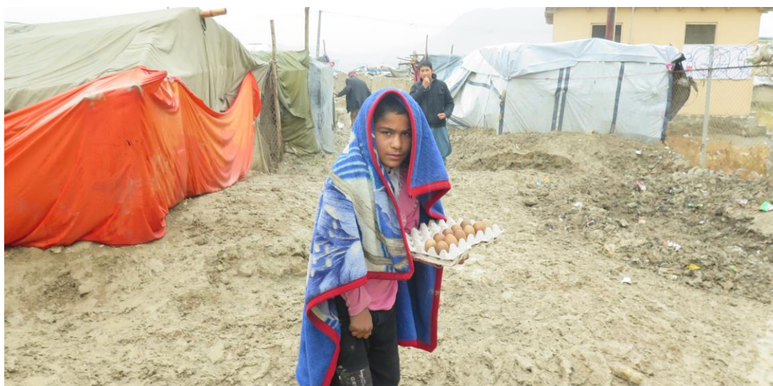
A 15-year-old boy in Kabul selling eggs at the local market to make a living. November 2015

building townships and roads, which is the mandate of other ministries. According to MoF officials, the MoRR failed to submit credible proposals for meeting the needs of displaced people in the 2016 budget because of “low capacity” and because “there is no mention of IDPs in [the MoRR’s] budget request”. 95