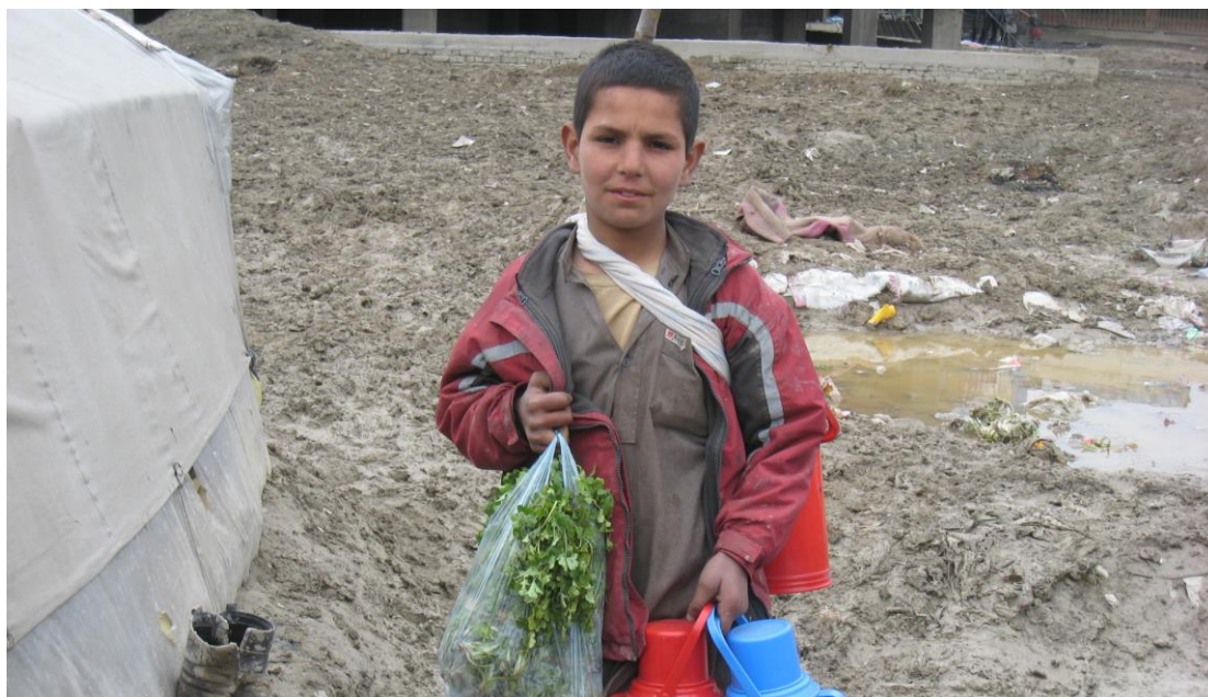
A 14-year-old boy in Charrahi Qambar settlement in Kabul, November 2015

Additionally, public hospitals only provide vaccinations and contraceptives free of charge, while other medicines must be bought from private clinics or pharmacies. While affording medicines is a struggle for many Afghans, it can be particularly difficult for displaced people who lack regular incomes and are often economically worse off than other urban poor (see more in section 4.5: Employment). Some displaced people reported having debts of several thousand Afs at private hospitals or pharmacies to buy medicines which they could not afford to pay back. One 55-year-old man in Naderabad camp in Mazar-e-Sharif said: