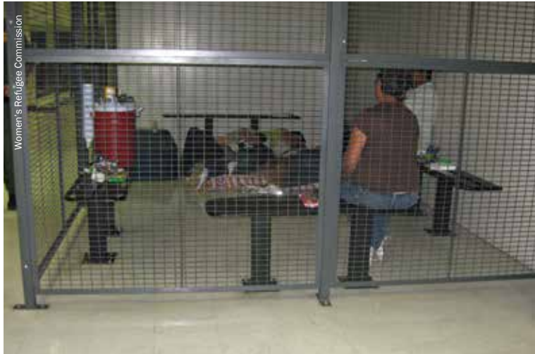
Family locked in holding cell, Tucson, Arizona, in the US.

In the context of deportation proceedings, according to the ECtHR, detention can only be justified for as long as proceedings are in progress, and "if such proceedings are not prosecuted with due diligence, the detention will cease to be permissible". 1 Irrespective of state claims to the contrary, detention of those awaiting deportation must be both proportionate and necessary; that the detainee in question is subject to removal is not sufficient justification.