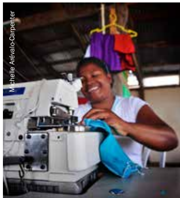
A self-employed refugee in Ecuador.

sector in Thailand, the government also created a formal migrant labour scheme that today employs around 1.3 million Burmese migrant workers, a substantial percentage of whom probably fit international definitions of a refugee. An estimated 1-1.5 million additional unregistered Burmese refugees and other migrants continue to work without formal permission. The consequence has been a reduction in local poverty in communities around Thailand and the encouragement of regional growth. On the negative side, Thailand does not acknowledge the refugee status of Burmese employed through the formal migrant labour scheme; this means that workers' families may lack legal status and protection, and a worker's legal status lasts only while he or she is employed.