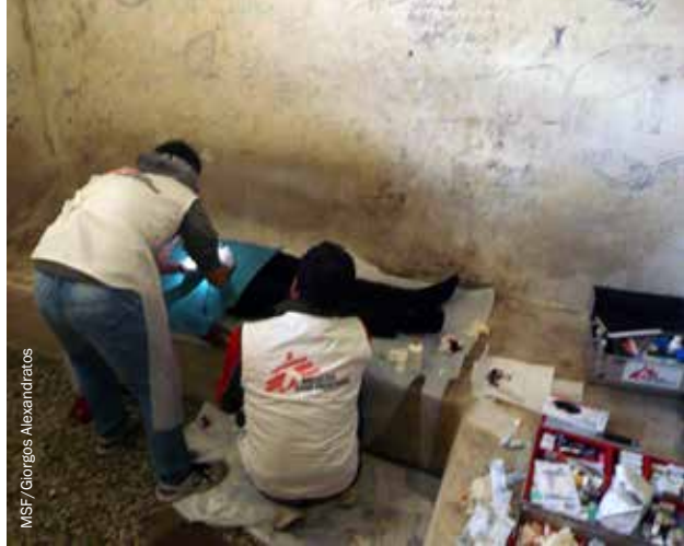
Providing medical care in detention, Greece.

Working in closed settings like prisons or detention centres poses ethical challenges for humanitarian organisations because of the risk of being perceived by detainees as complicit in the detention system. Thus this work requires a high level of responsibility and vigilance to safeguard the interest of patients' physical and mental health, in a context where operations fully depend