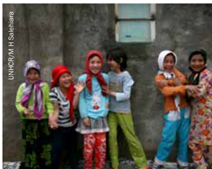
Afghan refugee girls in Torbate-Jam settlement, Iran.

Afghan refugees are also only allowed to work within their areas of residence. They cannot leave the designated areas for work without obtaining a Laissez-Passer . At times some designated areas of residence might be so limited that Afghans have difficulties finding employment within that area. In addition, Afghan refugees are only authorised to be hired for specific jobs, a provision which clearly limits their options for employment.