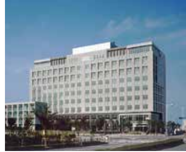
Osaka Immigration Bureau: part of it serves as detention facilities.

July 2011-June 2012: http://tinyurl.com/JapanMOJ-11-12