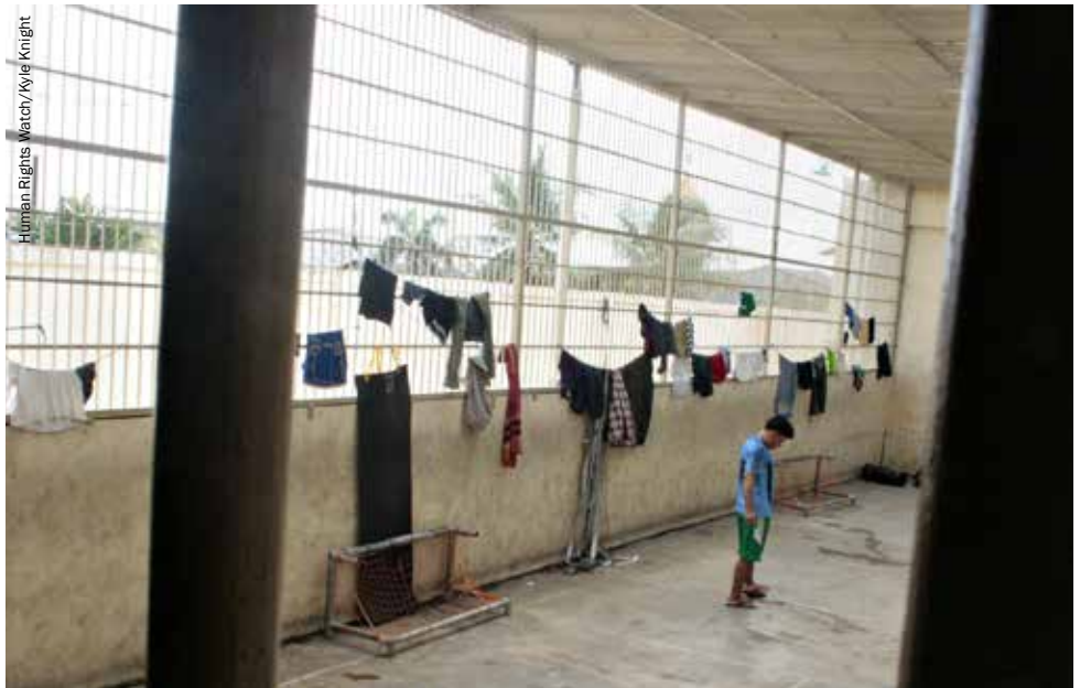
An Afghan asylum seeker walks in the courtyard used for outdoor recreation time at Belawan Immigration Detention Centre, North Sumatra.

UNHCR's Detention Guidelines emphasise that seeking asylum is not an unlawful act and, as such, even those who have entered or