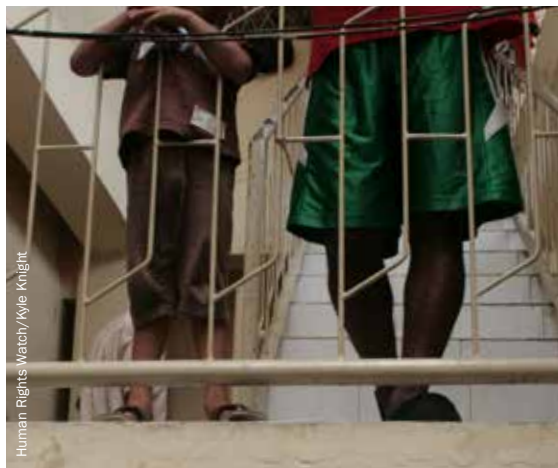
Two asylum-seeking boys at Belawan Immigration Detention Centre, North Sumatra.

months.... I want to be released and I don't want to stay longer.” Sharzad shared her cell with six adult women to whom she was not related and with whom she was unable to communicate.