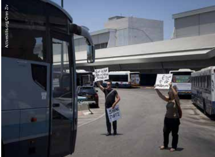
Israeli activists block a bus taking South Sudanese refugees to Ben Gurion airport to be deported to South Sudan.

lacking access to a fair asylum policy, and especially should not be applied in the case of countries like Eritrea and Sudan where returnees face a serious risk of persecution, or without inquiring as to whether the situation in the newly independent country of South