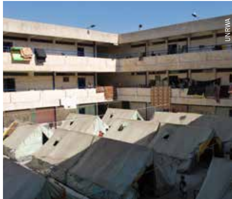
Internally displaced Palestine refugees, Jaramana refugee camp, Damascus Governorate, May 2013.

integrated students fleeing Syria within its wider school system in neighbouring countries. And with the temporary closure of a number of its 23 primary health-care centres due to their proximity to conflict, UNRWA has established new health points, relocating health services to newly displaced Palestine refugee populations.