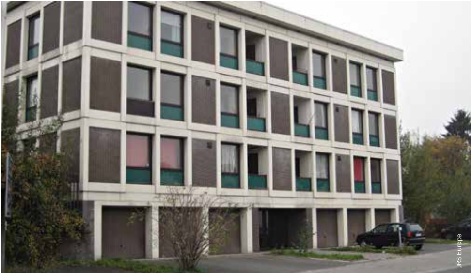
Building used to accommodate families in private apartments, plus office for a case worker. Tubize, Belgium.

Fifthly, there should be an emphasis on all possible outcomes. Alternatives to