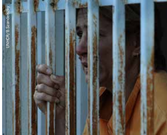
Asylum-seeking woman from Ukraine looking through the bars of the detention centre in Medvedov, Slovakia.

to gender and particular tasks in the prison which are gender-specific. There is no equivalent published policy guidance in the UK's immigration removal centres which detain women, and the facilities do not make public the proportion of female staff they employ.