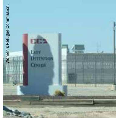
Eloy Detention Center, Arizona, US.

interventions to support compliance with conditions of release (e.g., appearances at removal hearings) in a manner that is more cost-effective than detention, respects human rights, improves integration and improves client health and welfare.