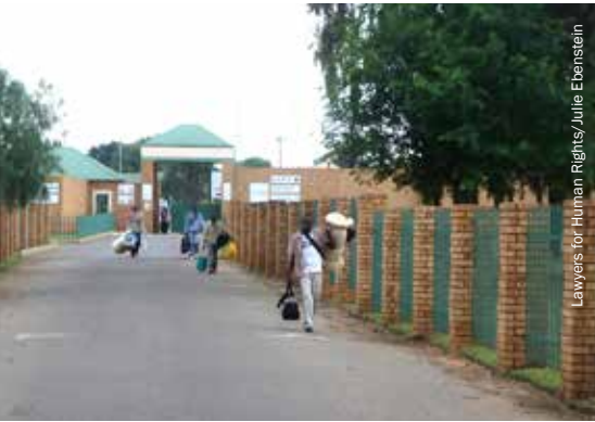
Release of a group of illegally detained asylum seekers, Lindela Repatriation Centre.

Inside Lindela, the flawed presumption that all detainees are illegal and by virtue of this illegality are also a security risk has legitimised the routine violation of detainee rights and legal protections. In one example, in justifying its defiance of the law’s clear and absolute 120-day limit on immigration detention, the Department of Home Affairs (DHA) 2 argued that it had complied as far as was “reasonably possible” with the law but believed that “the best interests of justice” warranted continuing to detain the individual indefinitely, and that releasing him in accordance with the law would in fact be “perpetuating illegality” by sending the “wrong message” to “illegal foreigners” in the country. The fact that the detainee in question was an asylum seeker who had wrongly been sent to Lindela after being acquitted of non-related criminal charges was irrelevant to the government’s detention decision, which it automatically framed as a security issue. The Department further admitted that it had not applied to a magistrate’s court, as required by law, for a warrant extending the detention beyond 30 days because as “creatures of statute” magistrates would be bound to adhere to the statutory requirements that the DHA believed it was entitled to ignore. In other words, the