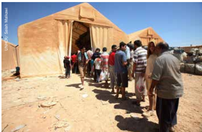
Syrian refugees queue for relief items at Za'atari camp, Jordan.

At least twice a month people queue up for their vouchers at warehouses or football stadiums in urban centres where a combination of 'non-food items' (from UNHCR), food vouchers (from WFP) and ad hoc gifts from Gulf states and philanthropic individuals are distributed. The registration process is meticulously designed to avoid fraud at an enormous cost of time and expense. The recipient then takes the voucher to a designated shop where agency staff 'monitor' the counter to ensure that the voucher is spent only on nutritious food items – no toothpaste, shampoo or chocolate.