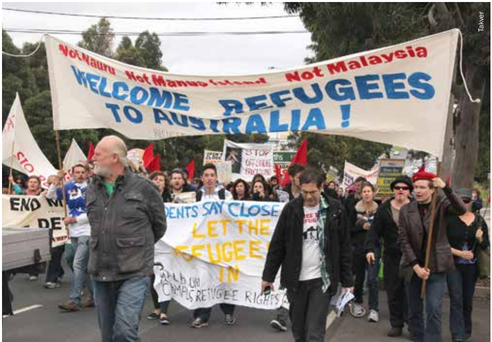
Rally organised by the Refugee Action Collective (Victoria) outside Broadmeadows Melbourne Immigration Transit Accommodation Centre, April 2013.

In early 2010, a group of advocates set about exploring appropriate models for the community detention of unaccompanied asylum-seeking minors. Consultations were held with a wide variety of stakeholders and providers of youth services; once a model was agreed upon and accommodation and service providers identified, a proposal was