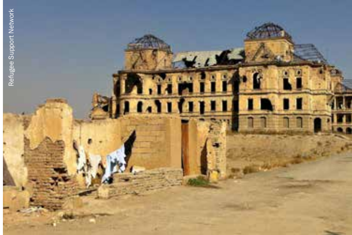
Refugee Support Network

Lack of education and employment opportunities: Young asylum seekers in the UK often describe education as one of the most positive and important things in their lives, and worry about the lack of opportunity they will have to continue their education and find employment if forced to return to Afghanistan. In a context of high unemployment and few opportunities, returnees face two specific additional problems: lack of appropriate school records, and low literacy rates in Dari or Pashtu. One Afghan professional said: “[the boys] come back with some English (often fairly basic and with lots of slang)