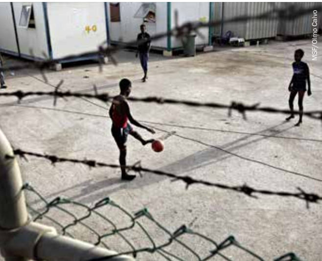
Detention centre, Malta.

the European Parliament and of the Council laying down standards for the reception of applicants for international protection (recast)' became law. 2