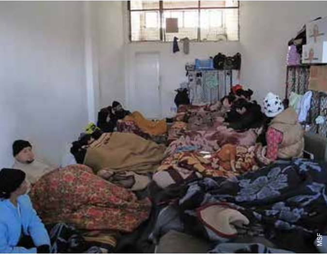
Detained migrants and asylum seekers in Greece.

very limited or no possibility to spend time outdoors. In nearly every detention centre there was no facility for isolating patients with communicable diseases.