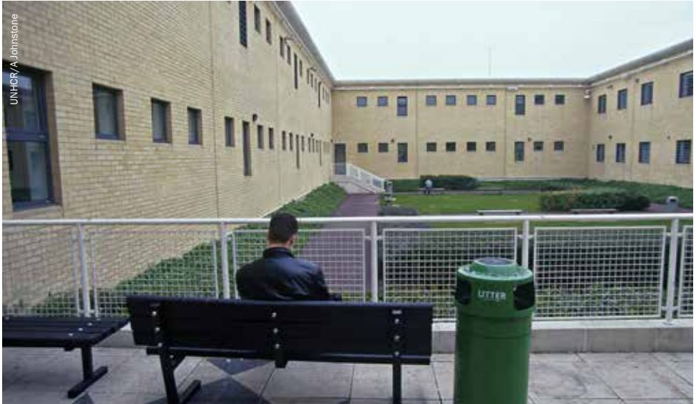
Asylum seeker awaiting deportation from Tinsley House immigration detention centre in the UK

trust, taking time throughout the immigration process to explore all potential long-term options, including leave to remain, assisted return and possibilities in third countries. These programmes have largely met the needs of governments as well as migrants, since very few migrants absconded and large proportions of those refused leave to remain decided to take up assisted return.