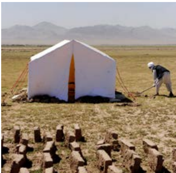
A displaced man puts up his tent in an Emergency Response camp in Herat province of Afghanistan.