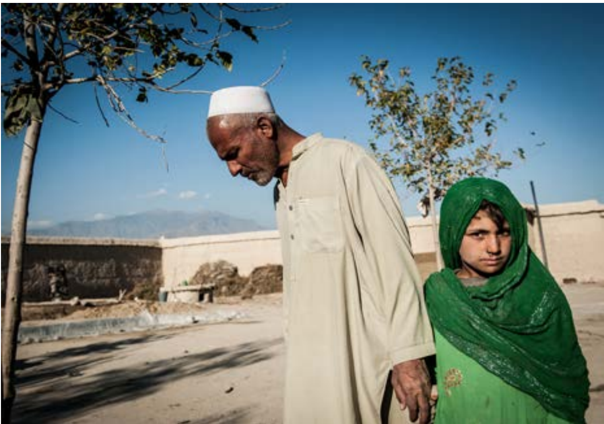
IDPs in Laghman province (NRC/Christian Jepsen, November 2013).

Afghanistan's 2004 Constitution guarantees a number of rights to housing, land and property relevant to the prohibition on forced evictions. 42 Under article 40(4), "nobody's property shall be confiscated without the provisions of law and the order of an authorized court." Article 38 further provides that, "no one, including the state, shall have the right to enter a personal residence [...] without the owner's permission or by order of an authoritative court, except in situations and methods delineated by law." 43 Article 14 requires that "the state shall adopt necessary measures for provision of housing and distribution of public estates to deserving citizens in accordance with the provisions of law and within financial possibilities." 44 However, none of the evictions planned or carried out in the studied communities had been authorised by a court order.