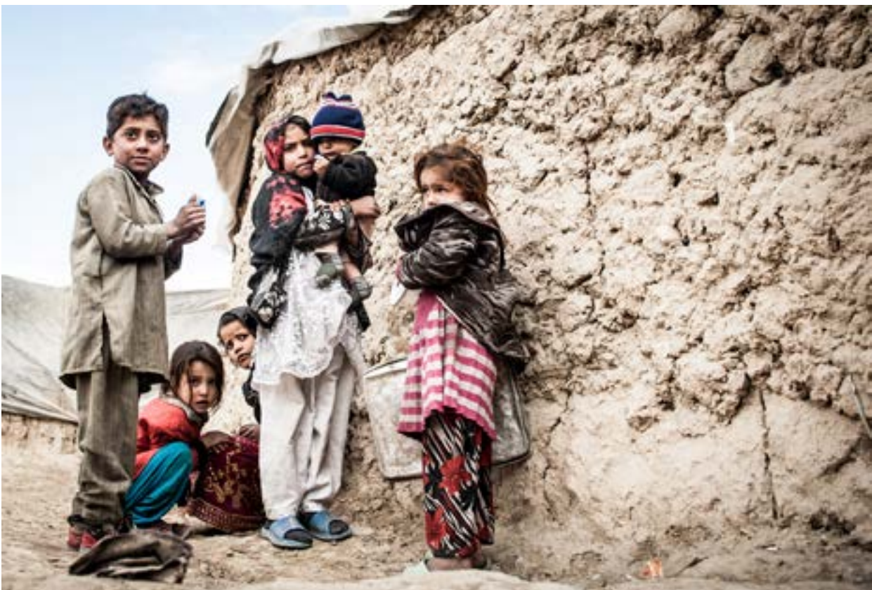
Internally displaced children in Kabul.

Although there have been limited positive changes, the state has insufficiently addressed issues around urban security of tenure. Appropriate legislation and land and housing policies are required to guarantee tenure security and urban development plans must take into account the needs and rights of the poorest and most vulnerable. Widespread land-grabbing for private gain by strongmen,