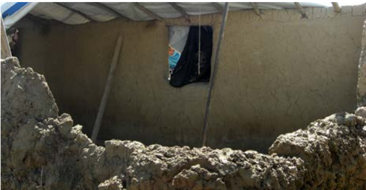
This housing in Nasaji Bagrami was reportedly damaged after heavy rains (IDMC/Caroline Howard, March 2013).

Roughly 60-70 per cent of urban areas in Afghanistan have developed informally. 12 The majority of informal settlements are located in or around the major cities